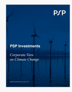
PSP Corporate View on Climate Change