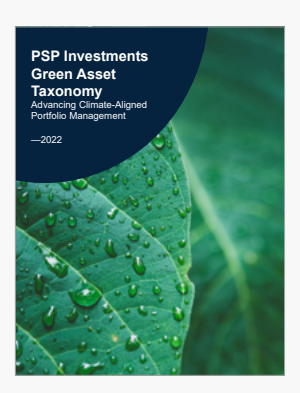
PSP Green Asset Taxonomy