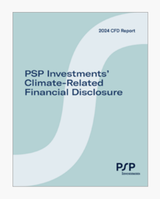
2024 PSP Investments' Climate-Related Financial Disclosures