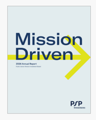
2024 Annual Report