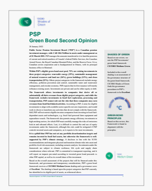
PSP Green Bond Second Opinion – CICERO Shades of Green