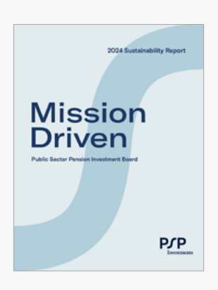
2024 Sustainability Report